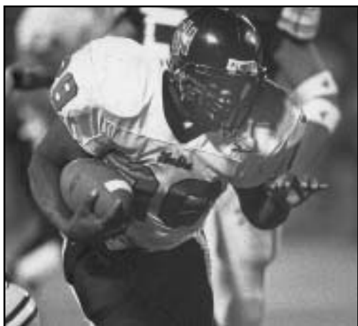
Thomas Hammock posted back-to-back 100-yard rushing seasons in 2000 and 2001.