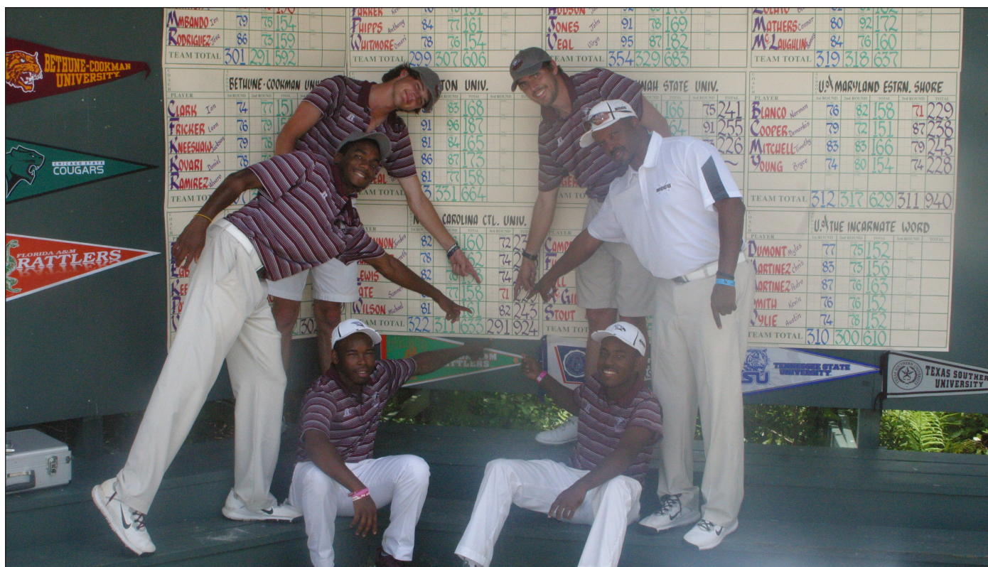
The 2015 NCCU Eagles posted the lowest round in program history with a team score of 291 at the 29th PGA Minority Collegiate Championship in Port St. Lucie, Fla.