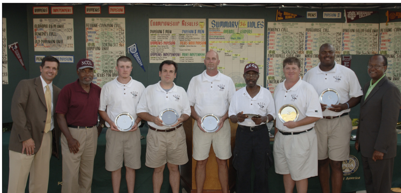
The 2006 NCCU Eagles rallied for a third place finish at the 20th PGA Minority Collegiate Championship in Port St. Lucie, Fla.