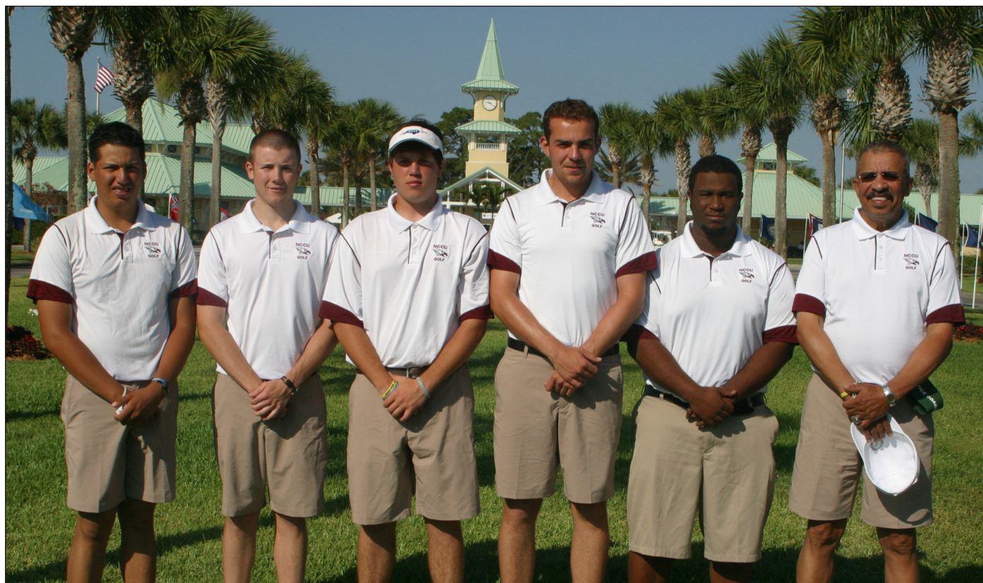
The 2009 NCCU Eagles tied for fifth place in the Division I standings at the 23rd PGA Minority Collegiate Championship.

on Sunday to finish first and second respectively in the individual medalist portion of the event as they led the NCCU rally en route to the team title.