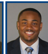
CHA'PELLE BROWN CORNERBACKS