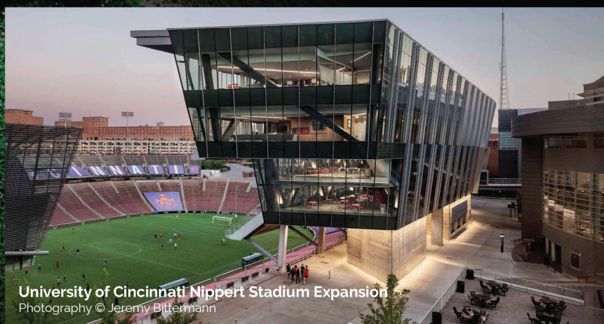
University of Cincinnati Nippert Stadium Expansion