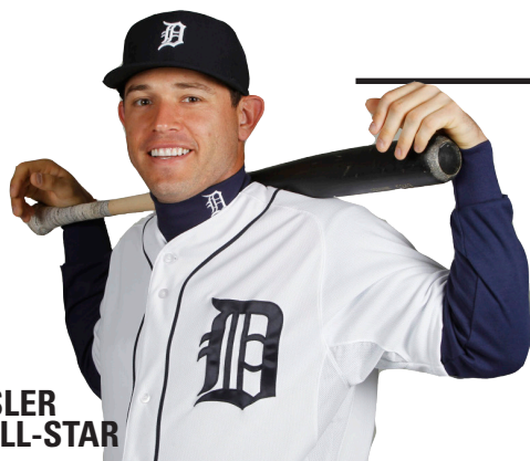
IAN KINSLER 4-TIME ALL-STAR

► Scherzer signed a seven-year deal worth $210 million with the Washington Nationals prior to the 2015 season. He tossed two no-hitters (one batter shy of a perfect game against the Pirates in June) and had two game scores of 97 or better, becoming the first to do that twice in a season since Pedro Martinez in 2000 - Nolan Ryan in 1990 is the only other pitcher to do so.