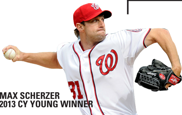
MAX SCHERZER 2013 CY YOUNG WINNER