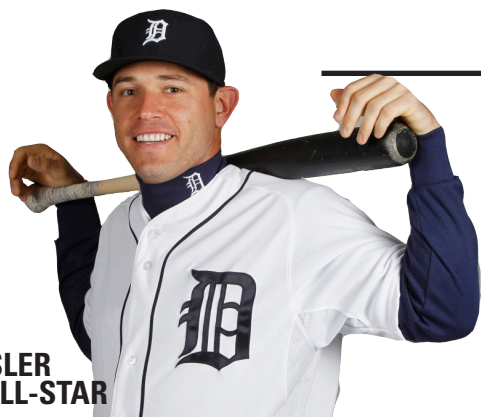
IAN KINSLER 4-TIME ALL-STAR

► Scherzer signed a seven-year deal worth $210 million with the Washington Nationals prior to the 2015 season. He tossed two no-hitters (one batter shy of a perfect game against the Pirates in June) and had two game scores of 97 or better, becoming the first to do that twice in a season since Pedro Martinez in 2000 - Nolan Ryan in 1990 is the only other pitcher to do so.