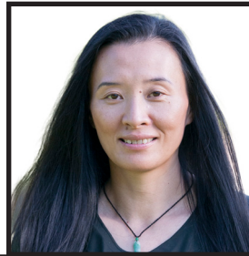
AC Deng Yang 16th Season