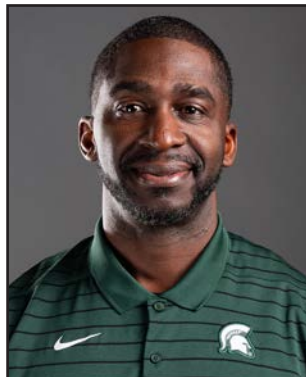
Blue Adams Secondary First Year at MSU Game Day Location: Sideline