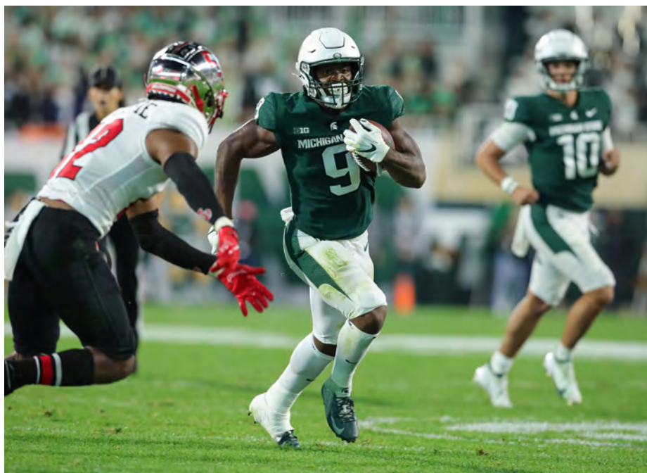
Kenneth Walker III leads the FBS in rushing, averaging 136.0 yards per game. According to Pro Football Focus, he also ranks first in yards after contact (515) and second with 19 rushes of 10-plus yards. Walker is averaging 155.8 rushing yards per game against FBS opponents this season.