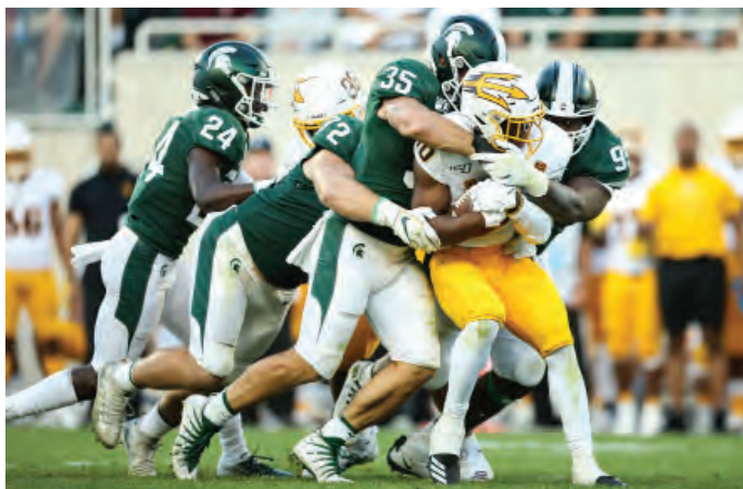
The Spartans held the Sun Devils to 216 yards of total offense (140 passing, 76 rushing).