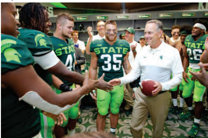
Michigan State's 2019 captains presented Mark Dantonio the game ball in the locker room following the Spartans' 51-17 victory over Western Michigan; with the win, Dantonio tied Duffy Daugherty for the most wins in program history.