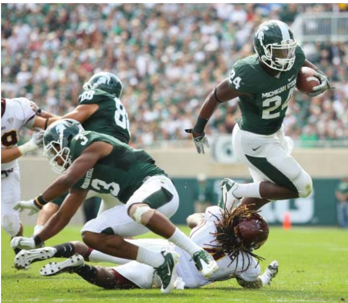
Le'Veon Bell tied his career high with three rushing touchdowns in the 45-7 win over Central Michigan.