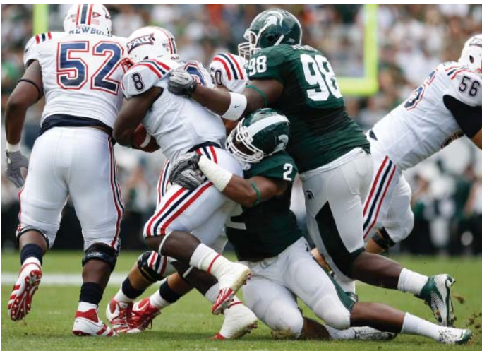
Michigan State's defense tied a school record by allowing just one first down to Florida Atlantic. The Spartans held the Owls to just 48 yards of total offense, the lowest output for an MSU opponent since 1965 (Notre Dame, 12 yards).