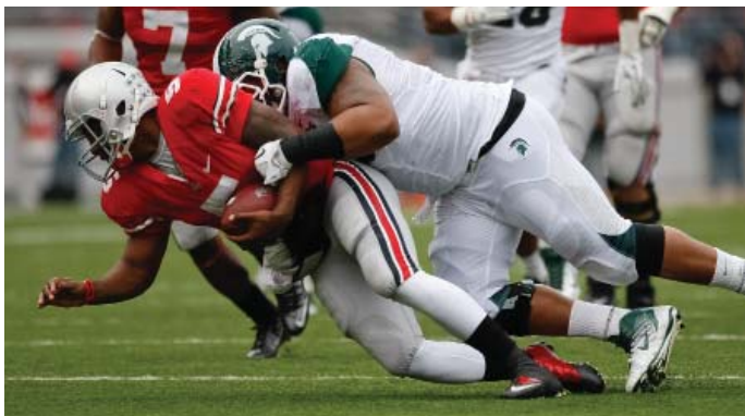
Michigan State's defense recorded nine sacks and 13 tackles for loss at Ohio State in limiting the Buckeyes to just 178 total yards of offense.

MSU: Bullough 9 (5-4), Lewis 8 (4-4), Norman 7 (7-0), Gholston 5 (5-0), Rush 4 (4-0); OSU: Howard 10 (5-5), Sweat 10 (4-6), Bryant 9 (7-2), Hankins 7 (7-0) Roby 4 (3-1).