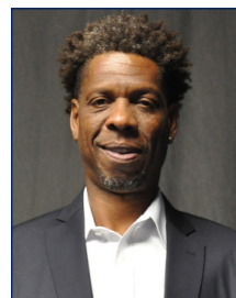
JR Reid Assistant Coach 4th Season North Carolina, 1994