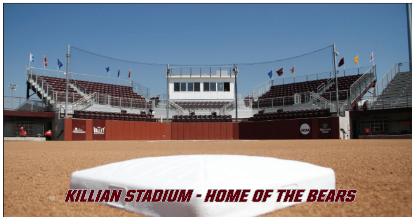
KILLIAN STADIUM - HOME OF THE BEARS