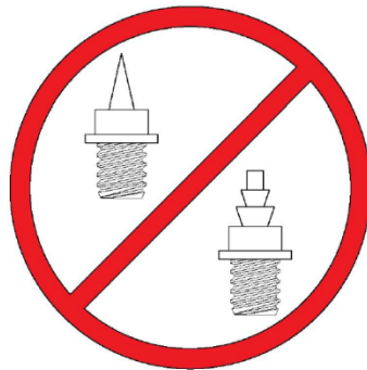
DAMAGING STEEL SPIKES