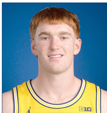
#5 | Oscar Goodman