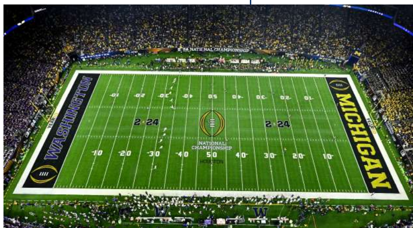
Three College Football Playoff Appearances: 2022, 2023, 2024