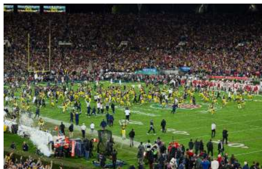
21 Rose Bowl Appearances The most of any Big Ten Conference school and the second-most all-time by any school