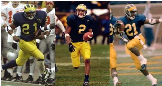
"The Game" between Michigan and Ohio State has been selected as the greatest rivalry in all of sports