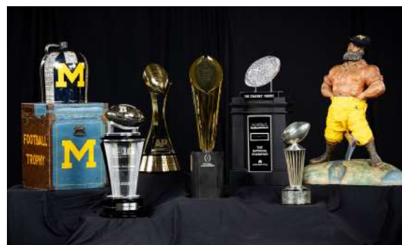
12 National Titles & 45 Big Ten Championships