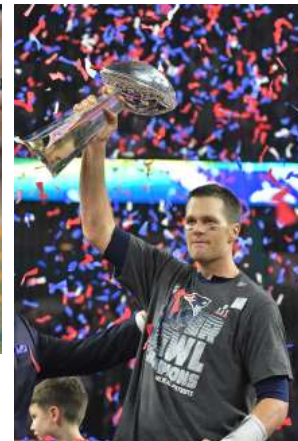
Tom Brady 7-time Super Bowl Champion 5-time Super Bowl MVP