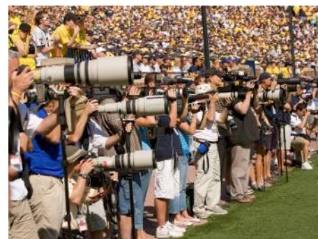
All-Time NCAA Leader in TV Appearances