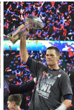
Tom Brady 7-time Super Bowl Champion 5-time Super Bowl MVP