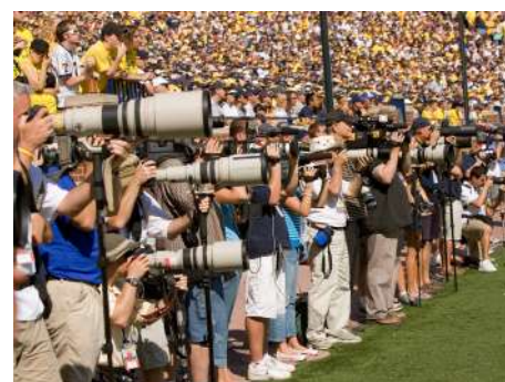
All-Time NCAA Leader in TV Appearances