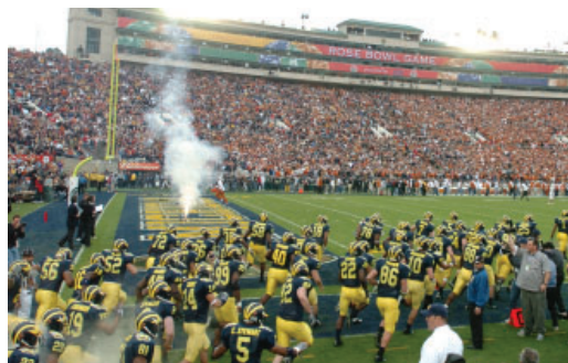
20 Rose Bowl Appearances The most of any Big Ten Conference school and the second-most all-time by any school