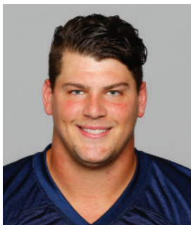
TAYLOR LEWAN, OL Tennessee Titans 6th Season