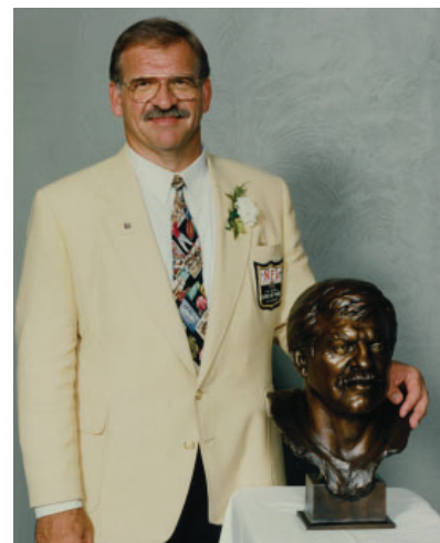
Dan Dierdorf 1996 Pro Football Hall of Fame Inductee; one of seven Wolverines enshrined