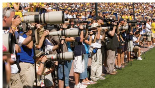
Michigan leads all of college football in television appearances