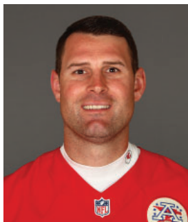
CHAD HENNE, QB Kansas City Chiefs 12th Season