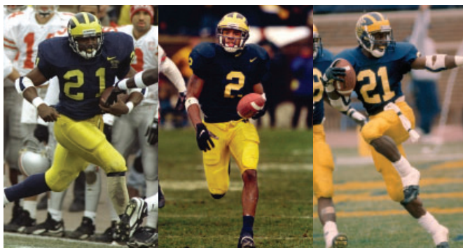
"The Game" between Michigan and Ohio State has been selected as the greatest rivalry in all of sports