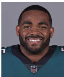
BRANDON GRAHAM, DE Philadelphia Eagles 10th Season