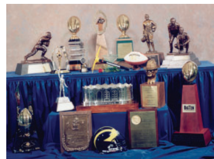
11 National Titles & 42 Big Ten Championships