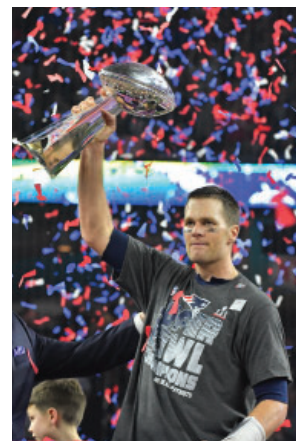
Tom Brady Five-time Super Bowl Champion Four-time Super Bowl MVP