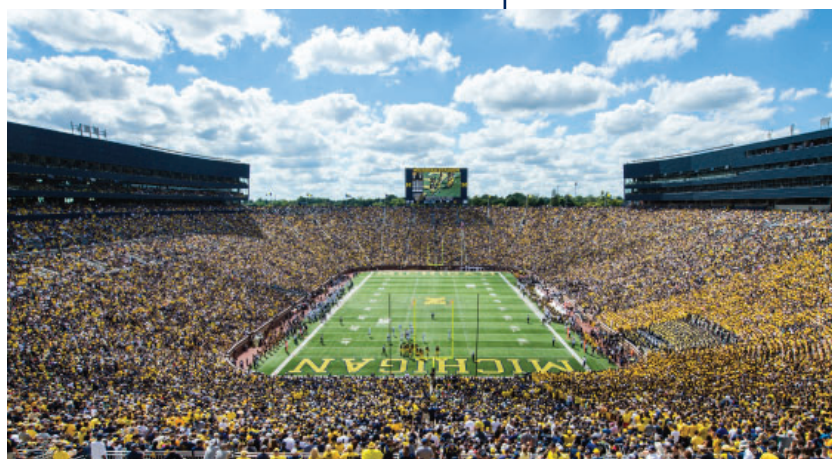
Michigan Stadium (107,601) is the largest venue in college and professional football