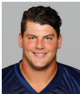
TAYLOR LEWAN, OL Tennessee Titans 6th Season