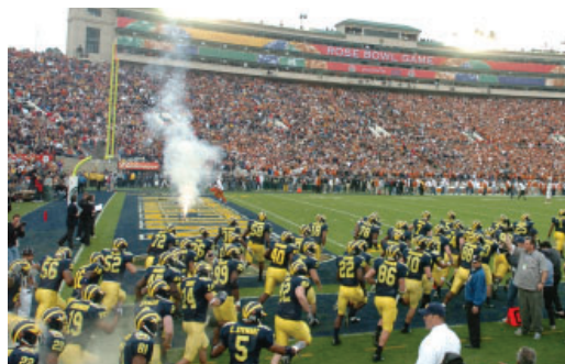
20 Rose Bowl Appearances The most of any Big Ten Conference school and the second-most all-time by any school