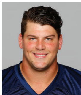
TAYLOR LEWAN, OL Tennessee Titans 6th Season