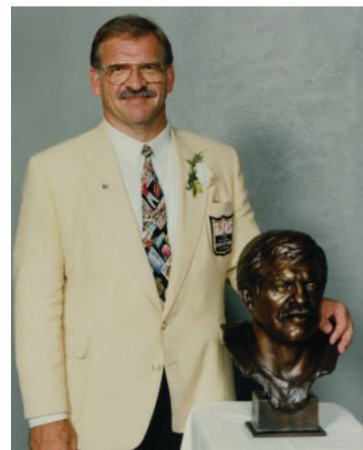
Dan Dierdorf 1996 Pro Football Hall of Fame Inductee; one of seven Wolverines enshrined