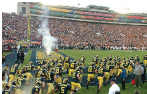
20 Rose Bowl Appearances The most of any Big Ten Conference school and the second-most all-time by any school