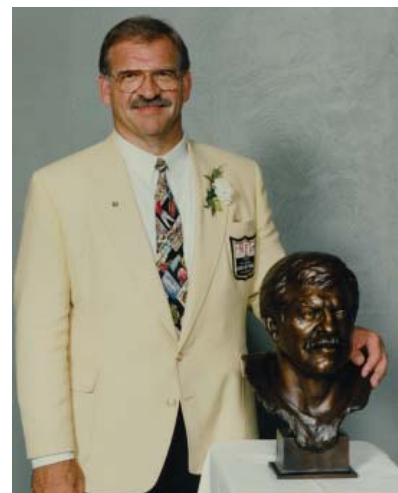
Dan Dierdorf 1996 Pro Football Hall of Fame Inductee; one of seven Wolverines enshrined