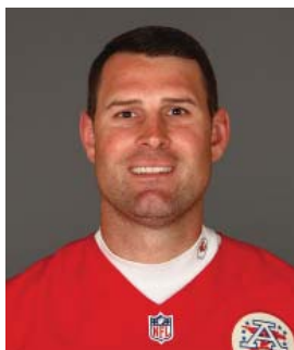
CHAD HENNE, QB Kansas City Chiefs 11th Season