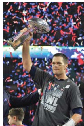
Tom Brady Five-time Super Bowl Champion Four-time Super Bowl MVP