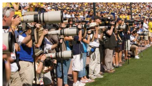
Michigan leads all of college football in television appearances