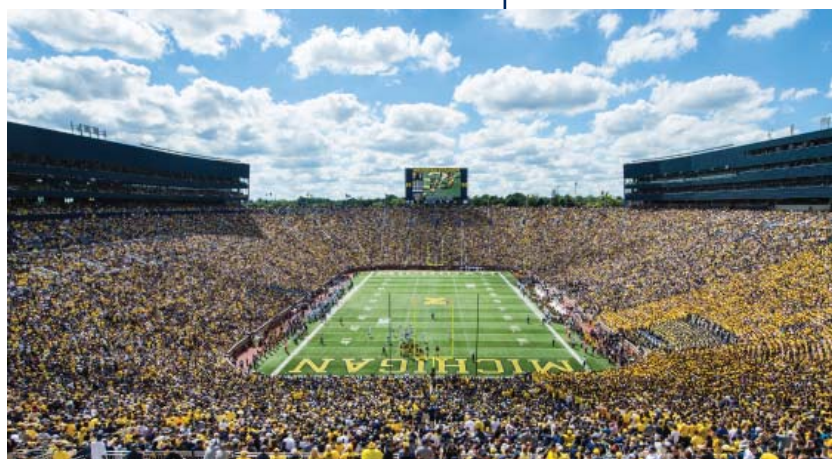
Michigan Stadium (107,601) is the largest venue in college and professional football