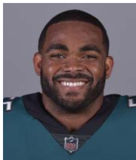
BRANDON GRAHAM, DE Philadelphia Eagles 9th Season