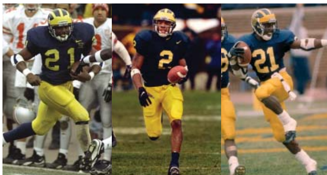
"The Game" between Michigan and Ohio State has been selected as the greatest rivalry in all of sports