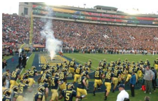
20 Rose Bowl Appearances The most of any Big Ten Conference school and the second-most all-time by any school