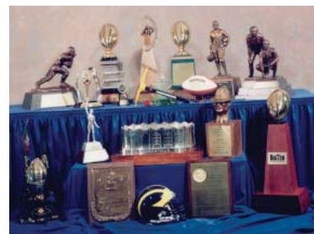
11 National Titles & 42 Big Ten Championships