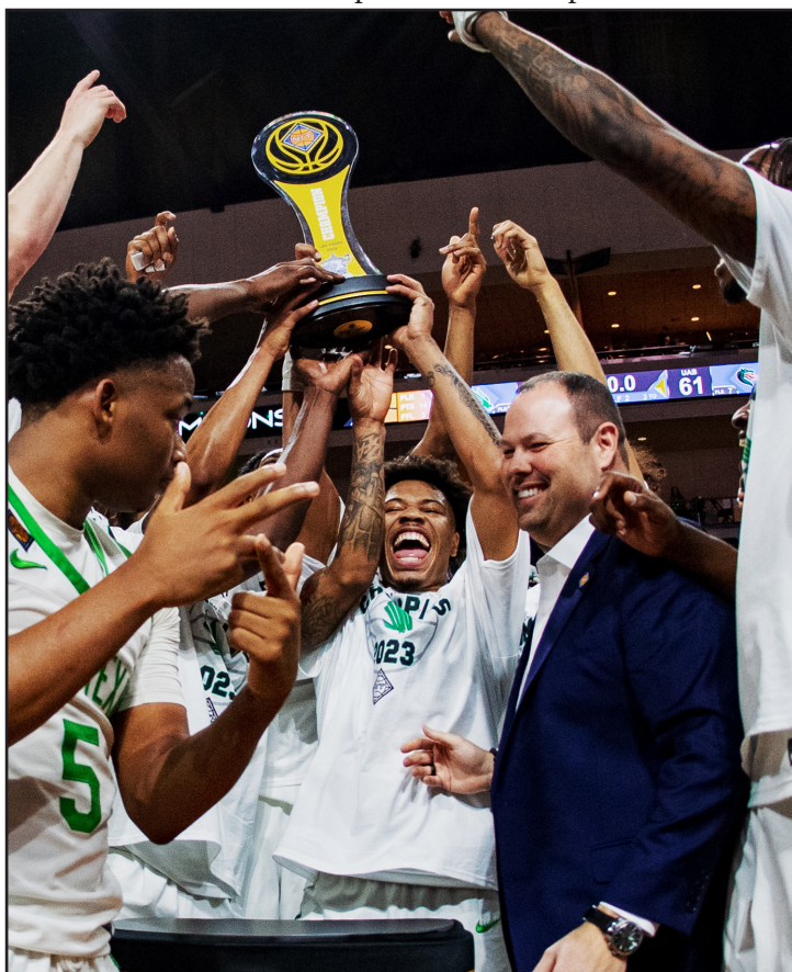
2023 NIT CHAMPIONS