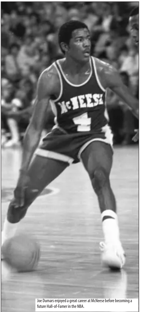
Joe Dumars enjoyed a great career at McNeese before becoming a future Hall-of-Famer in the NBA.