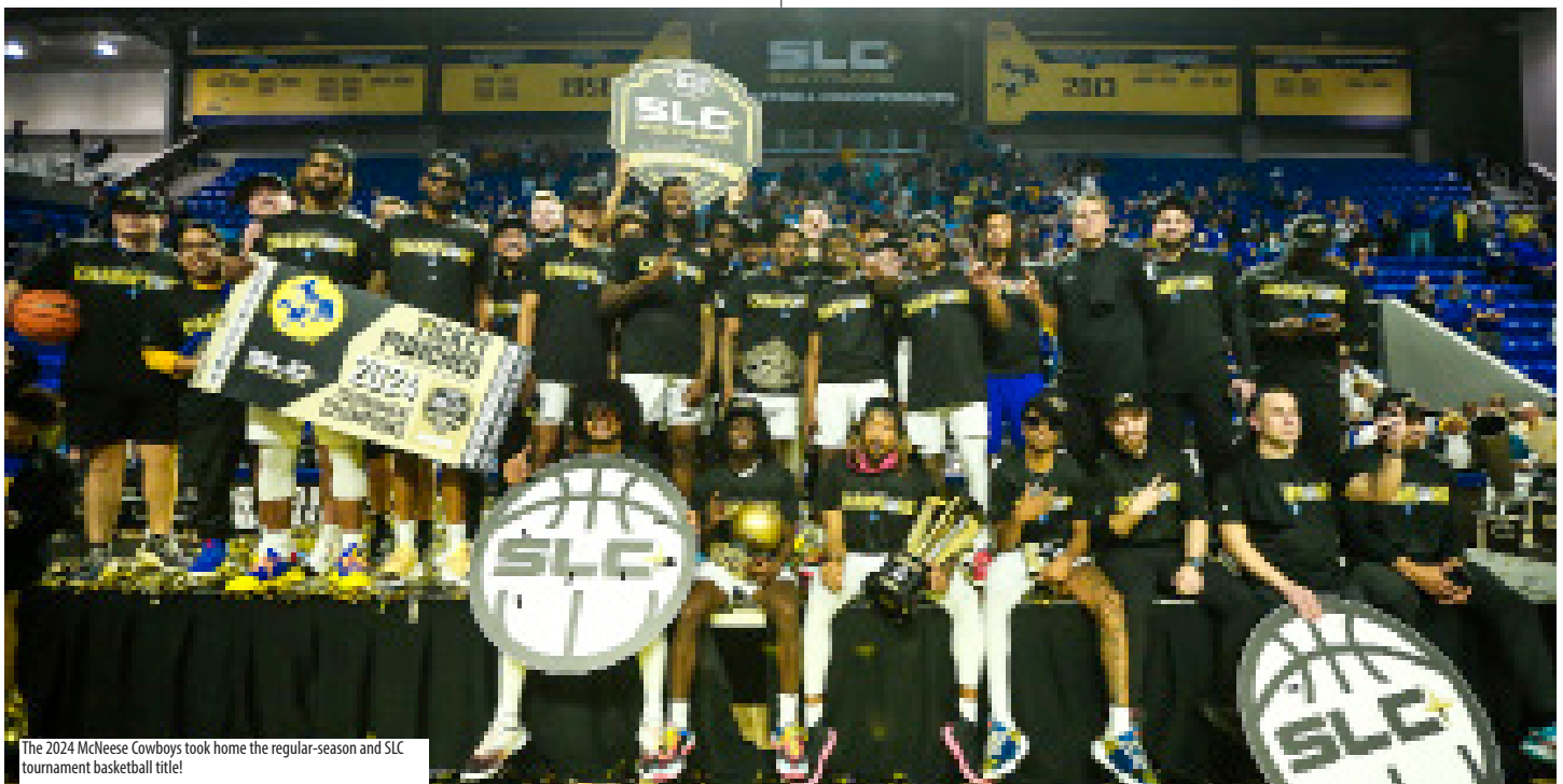
The 2024 McNeese Cowboys took home the regular-season and SLC tournament basketball title!