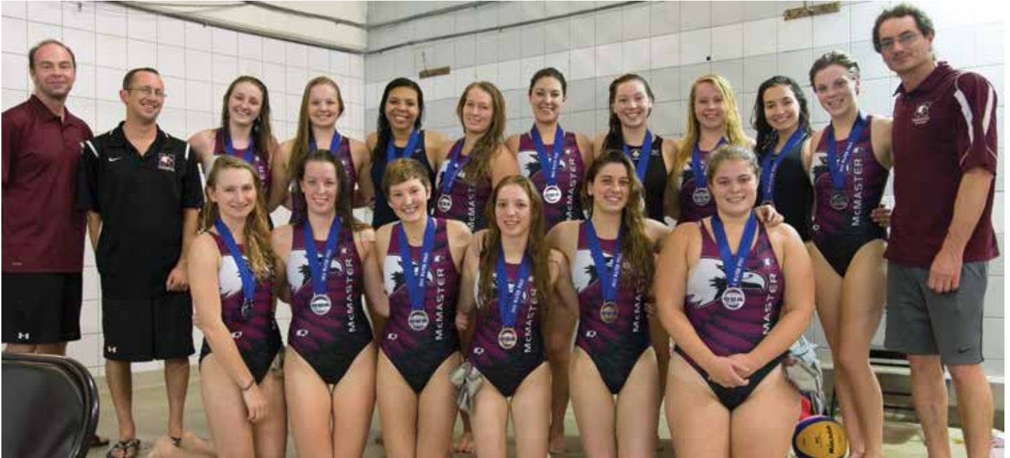
Springing an opening-round upset against the Ottawa Gee Gees, the Marauder women reached their best finish at the OUA Championships since 2007.

Making the most of their status as hosts, the Marauder women's water polo team enjoyed their best showing at the OUA Championships since 2007, advancing to the conference final in their home pool at the Ivor Wynne Centre. Their male counterparts in maroon and grey also did their part to keep the home fans engaged, advancing to the bronze medal match on championship Sunday before ultimately finishing fourth.