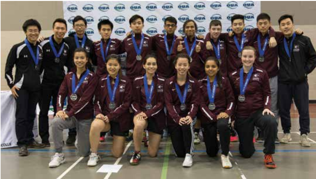
Their silver medal was McMaster's best ever finish at the OUA Championship, and it was achieved on home court.

Despite a sluggish start in the opening match of the tournament, which saw McMaster concede three head-to-heads against the Queen's Gaels, the Marauders took the overall victory 7-3 by sweeping the women's singles and doubles and the mixed doubles matches. The hosts rolled to their second victory of the weekend in the Friday night session, blanking the Carleton Ravens 10-0 to put themselves in prime position on Day 2.