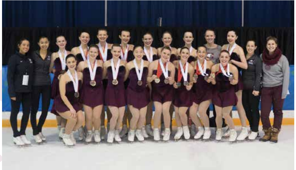
McMaster's synchronized group won the team's second gold medal of the OUA Championship in its final event.

Their conference finish in 2016 marked a nine-point improvement from McMaster's fourth-placed position of a season ago.