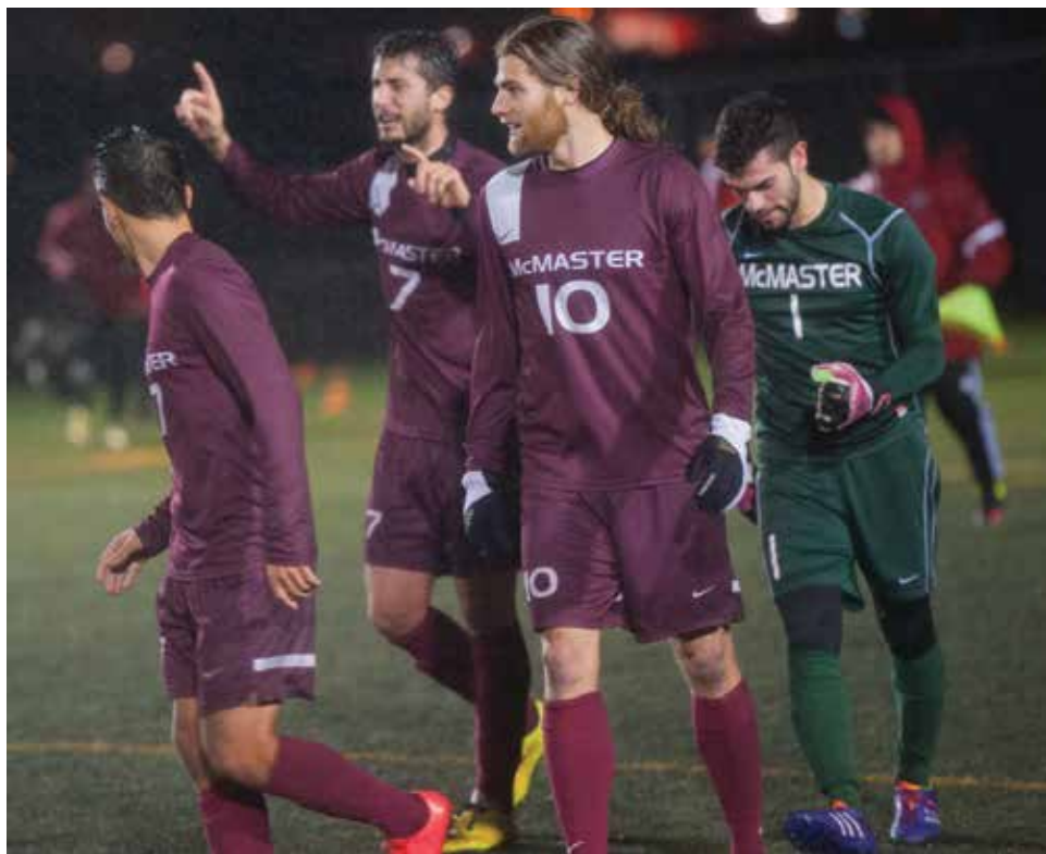
The Marauders knocked the UQAM Citadins out of the CIS Championship in a rainy shootout.

That's when the team's story began to take its turn toward the strange and wonderful.