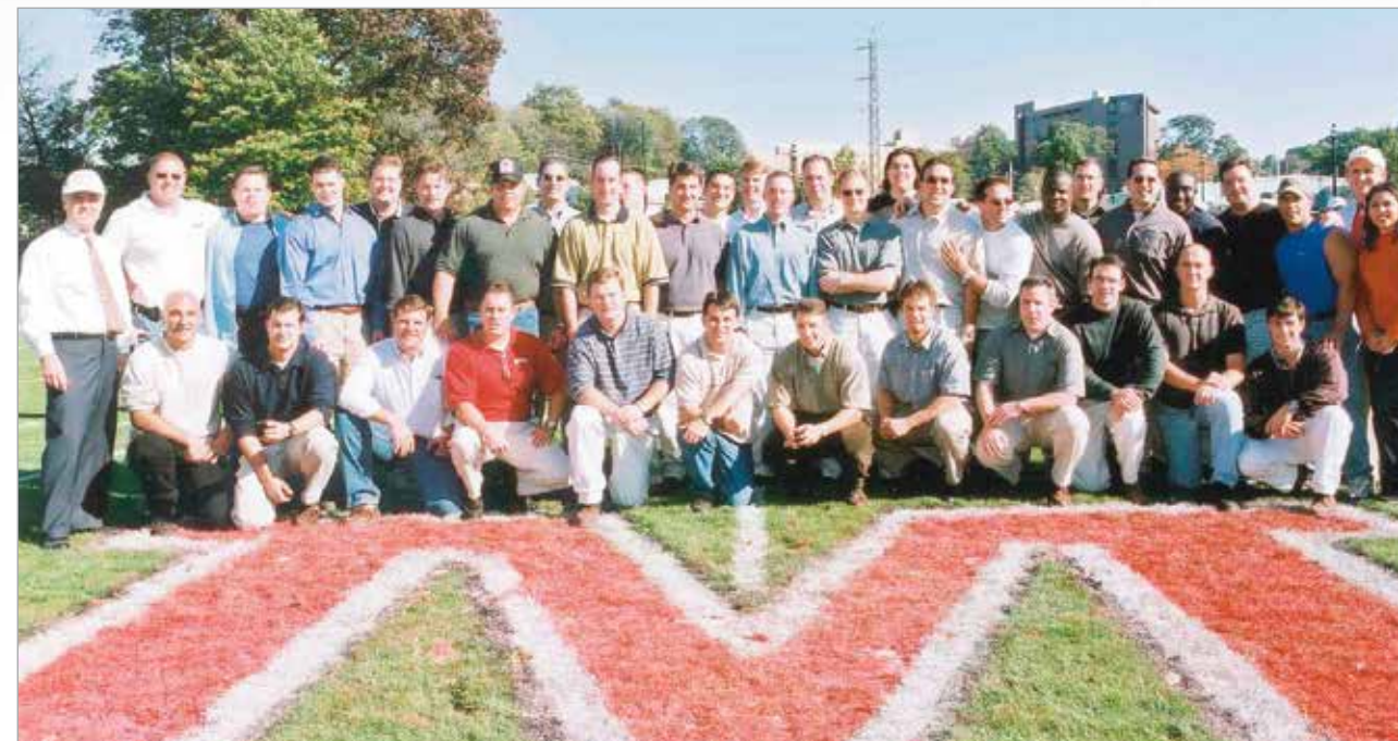
A 10-year reunion of the 1990 ACFC Championship team was held on Oct. 14, 2000.