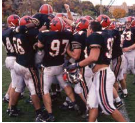
1994 MAAC championship team