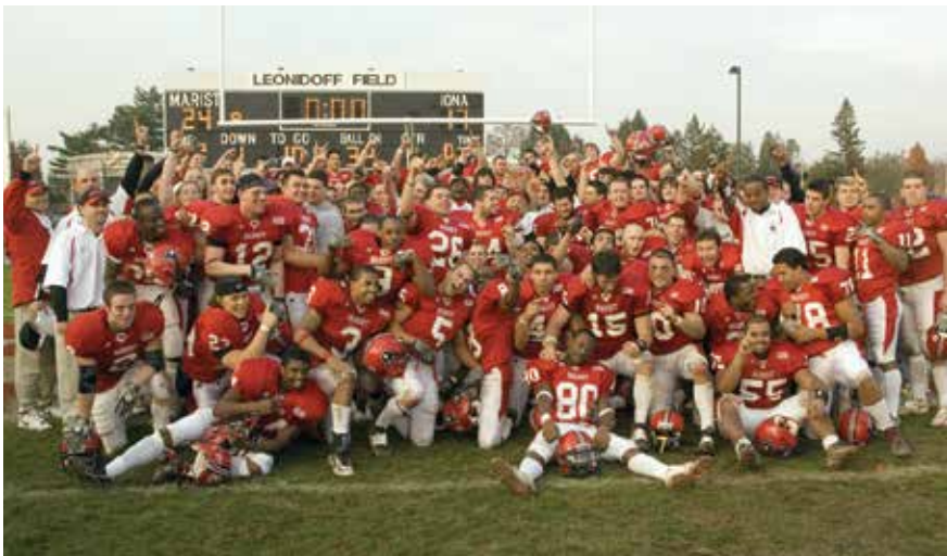
2006 MAAC championship team