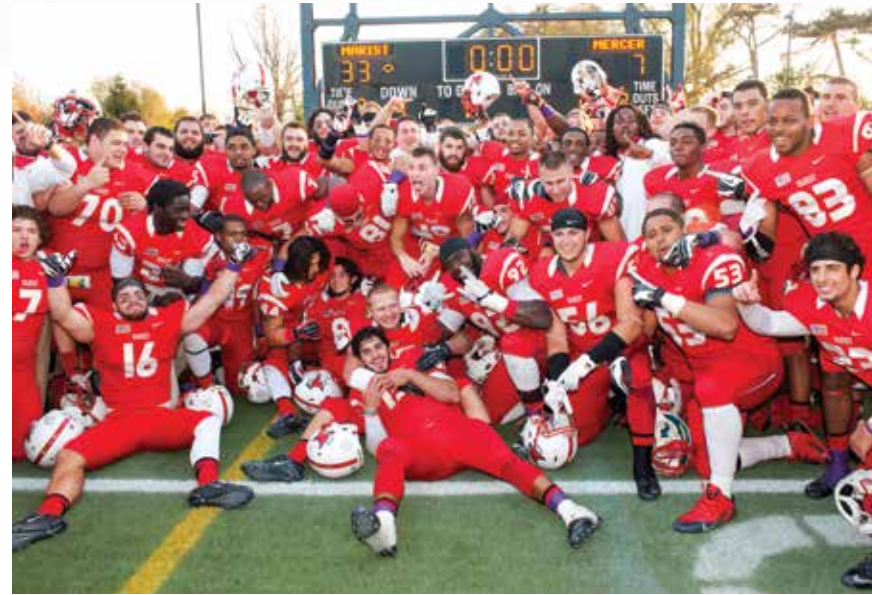
2013 PFL championship team