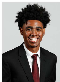
0 Saint Thomas F / 6'7" / 200 lbs Omaha, Neb. Millard North