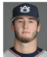
11 CHASE HALL