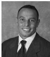
Art Asselta Quarterbacks