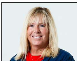
Dr. Dot Richardson Head Coach - 11th Year UCLA ('83)