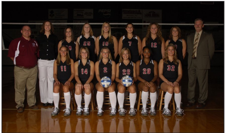
The 2006 Lenoir-Rhyne Volleyball Team won the South Atlantic Conference regular season title for the second time in three years. The Bears finished 25-13 overall including a 12-2 mark in league play and their victory total was the third-most in school history.