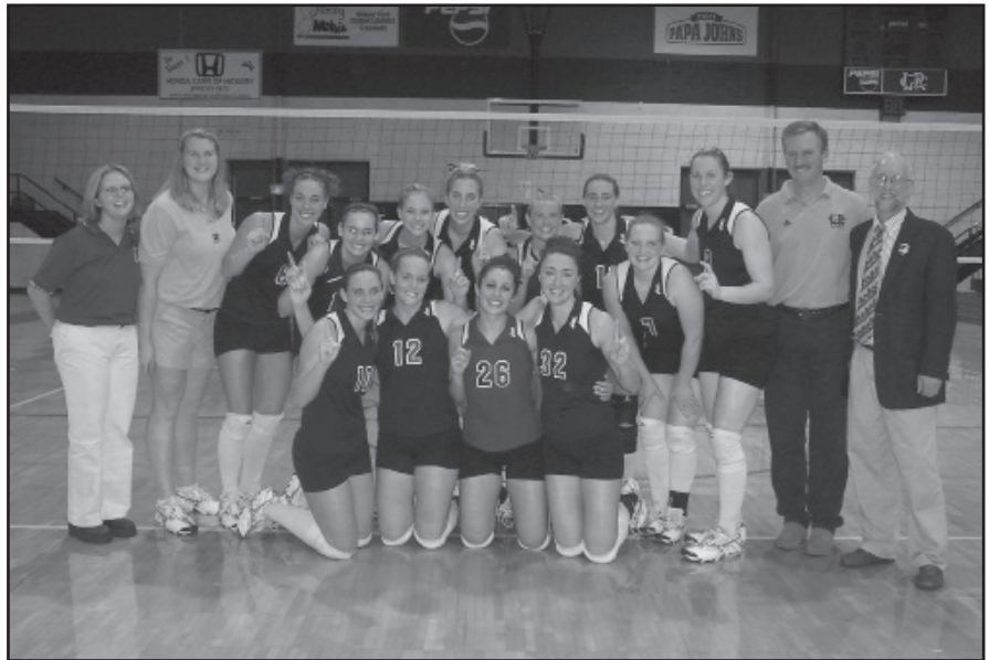
The Lenoir-Rhyne Volleyball Team won its first-ever SAC Regular Season Championship in 2004 and qualified for the NCAA Division II Tournament. This photo was taken after the Bears captured the title on Nov. 2, 2004, with a 3-0 win over Mars Hill at Shuford Gym.