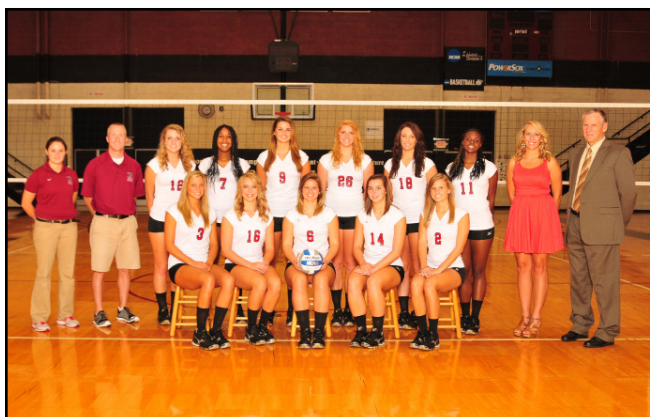
The 2012 Lenoir-Rhyne University Volleyball Team finished the year with a record of 19-12 overall and earned its second NCAA Division II playoff berth in school history.

9/9..... vs. Concordia (N.Y.).....W .... 3-1 9/14..... *NEWBERRY .....W .... 3-0 9/19..... *TUSCULUM .....L ..... 2-3 9/21..... *at Carson-Newman .....L ..... 1-3 9/23..... *MARS HILL .....W .... 3-0 9/26..... *PRESBYTERIAN .....W .... 3-2 9/28..... *at Wingate .....L ..... 0-3 10/3..... *at Catawba .....L ..... 1-3 10/6..... %PFEIFFER .....W .... 3-0 10/6..... %QUEENS (N.C.).....W .... 3-0 10/7..... %N.C. CENTRAL.....W .... 3-0 10/7..... %CATAWBA .....L ..... 1-3 10/10..... GARDNER-WEBB .....L ..... 1-3 10/12..... *at Newberry .....L ..... 0-3 10/13..... #vs. USC Aiken .....L ..... 0-3 10/14..... #vs. Florida Southern .....L ..... 1-3 10/14..... #vs. Rollins.....L ..... 0-3 10/15..... *CARSON-NEWMAN.....W .... 3-1 10/19..... *at Tusculum .....L ..... 1-3 10/24..... *at Mars Hill.....W .... 3-1 10/28..... ^at Tusculum.....L ..... 0-3 10/31..... QUEENS (N.C.).....W .... 3-0 * South Atlantic Conference match @ Carolina Phone Classic (Spartanburg, S.C.) % Active Ankle Volleyball Challenge (Hickory, N.C.) # Moccasin Invitational (Lakeland, Fla.) ^ Food Lion SAC Tournament (Greenville, Tenn.)