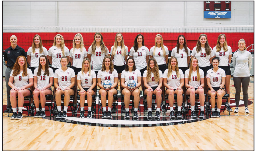
The 2021 Lenoir-Rhyne Volleyball Team became the second team in program history to advance to an NCAA Sweet 16 and also the second team to bring home a SAC Tournament Championship. The '21 Bears earned the first-ever No. 1 seed in the NCAA Tournament.