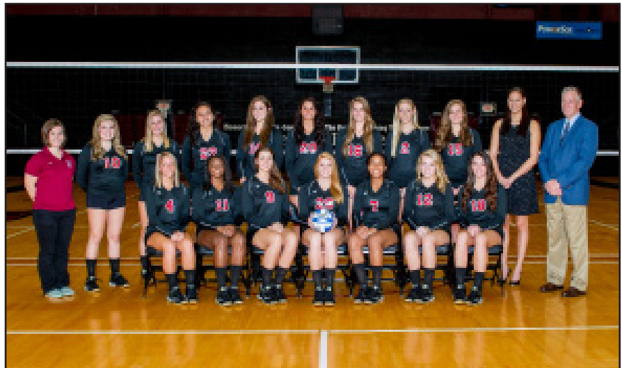
The 2014 Lenoir-Rhyne Volleyball Team earned an NCAA Division II Playoff berth for the third time in school history. The Bears finished with a 22-10 overall mark including a 15-7 ledger in conference play.