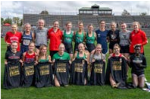
2023 Women's College Gold Top Finishers