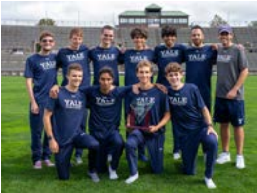
2023 Men's Gold Team Champions, Yale