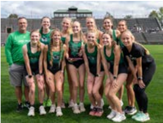
2023 Women's Gold Team Champions, Utah Valley