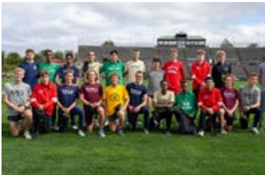
2023 Men's College Gold Top Finishers