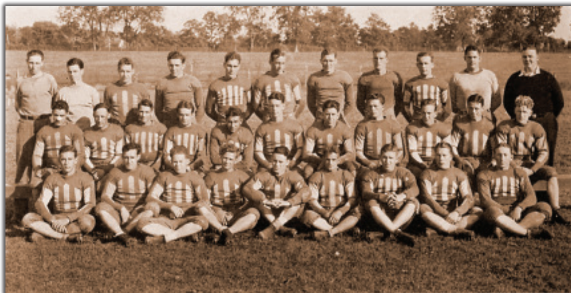
1929 Kentucky Wesleyan Panthers