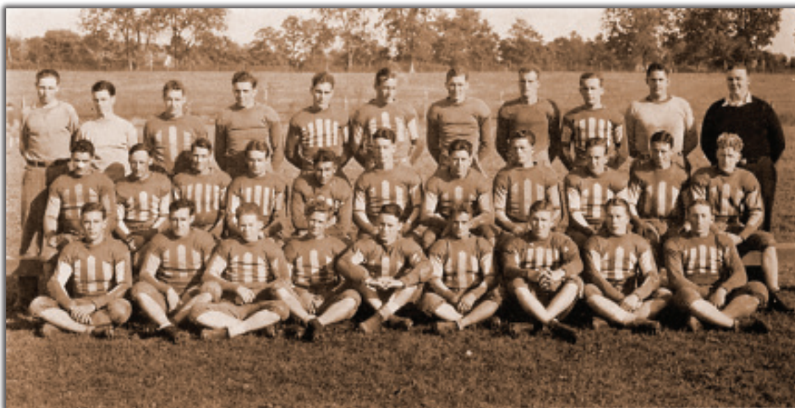
1929 Kentucky Wesleyan Panthers