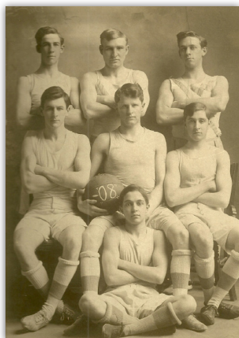
The 1907-08 KWC Basketball Team