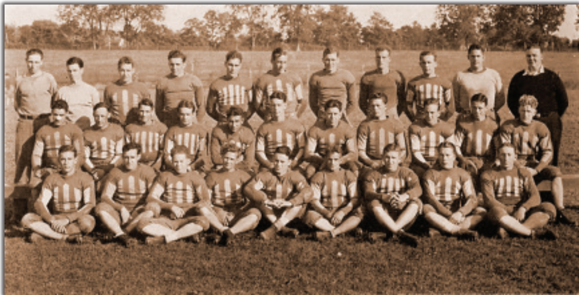
1929 Kentucky Wesleyan Panthers