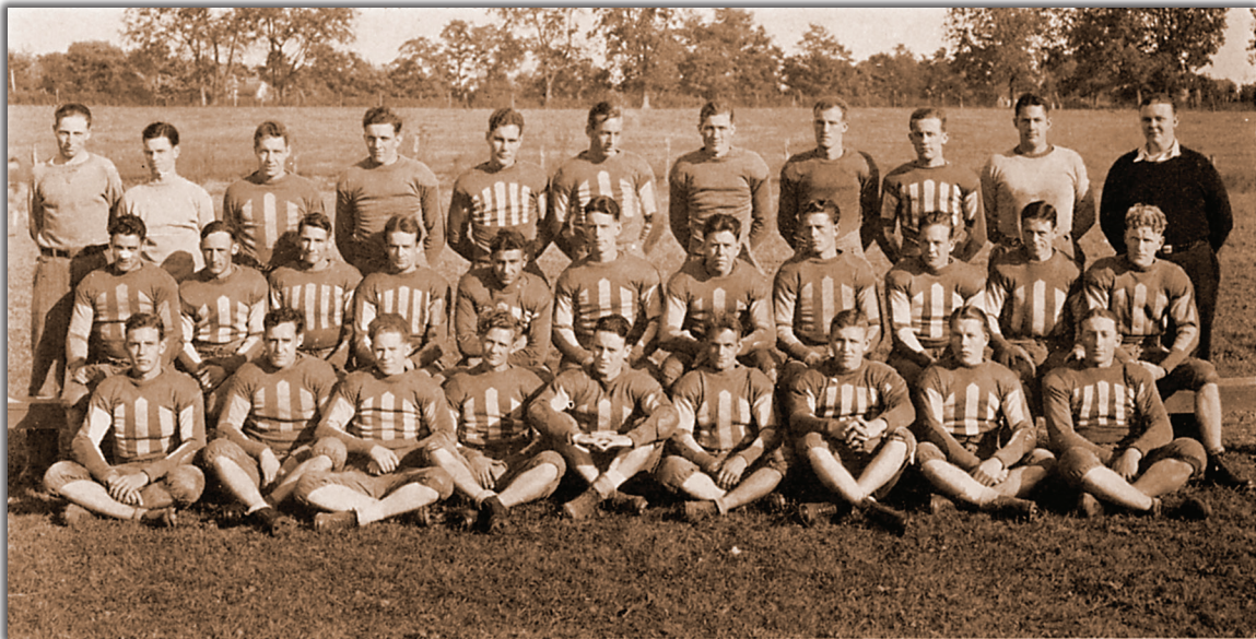
1929 Kentucky Wesleyan Panthers