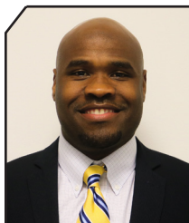
Justin Hood Secondary