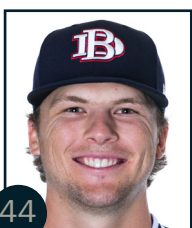
44 RIVER RIDINGS