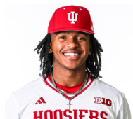
13 | Andrew Wiggins OF | L/R | Fr. Indianapolis, Ind.