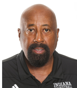
MIKE WOODSON Head Coach Third Year at IU 56-32