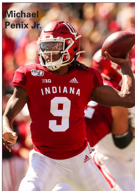
Michael Penix Jr.