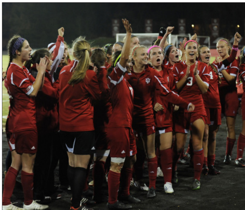
The Hoosiers celebrating their 1-0 win over DePaul in the 2013 NCAA Tournament.