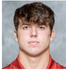
Colby Runner 184