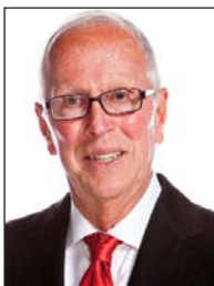
Head Coach STEVE FISHER

PPG: -- RPG: -- APG: -- FG%: -- 3FG: -- FT%: --