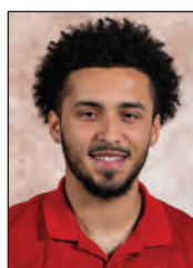
PADYN BORDERS Graduate Manager