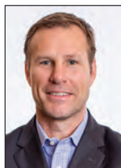
FRED HOIBERG Head Coach