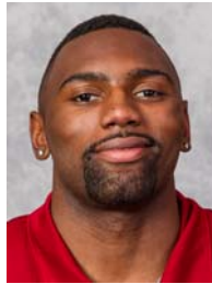
and 163 against East Central. In the first four games of the season, he totaled just 152 yards.