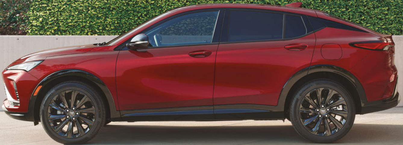
As shown $27,280. 1 Sport Touring shown with available features.