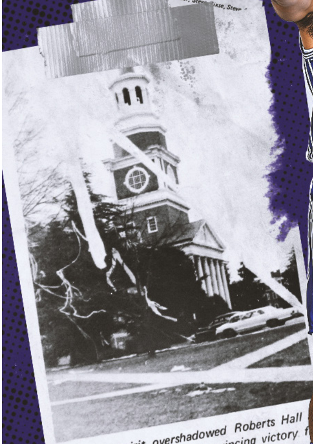
Basketball spirit overshadowed Roberts Hall veils of tissue asserted a convincing victory for Panther Power.