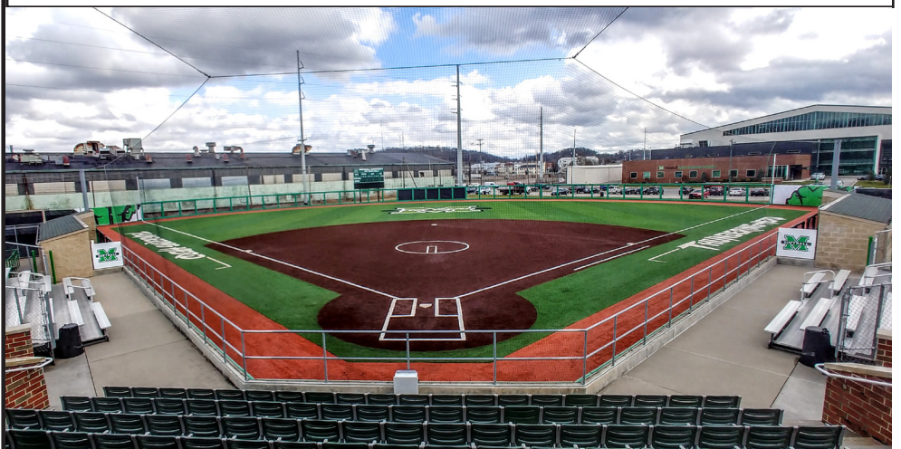
Dot Hicks Field